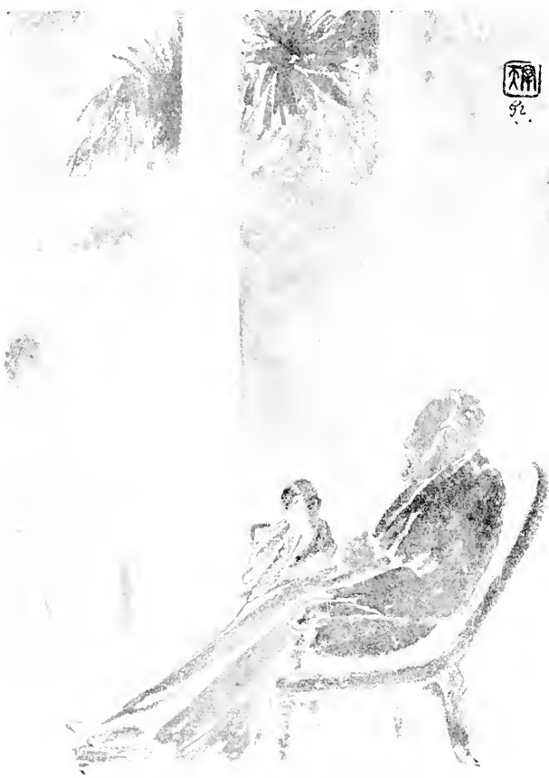
SINGING TO MY FATHER